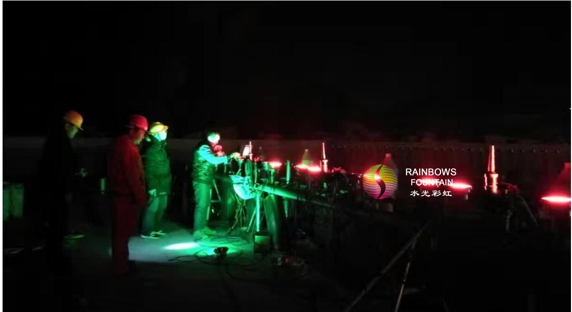
Engineers with client on site