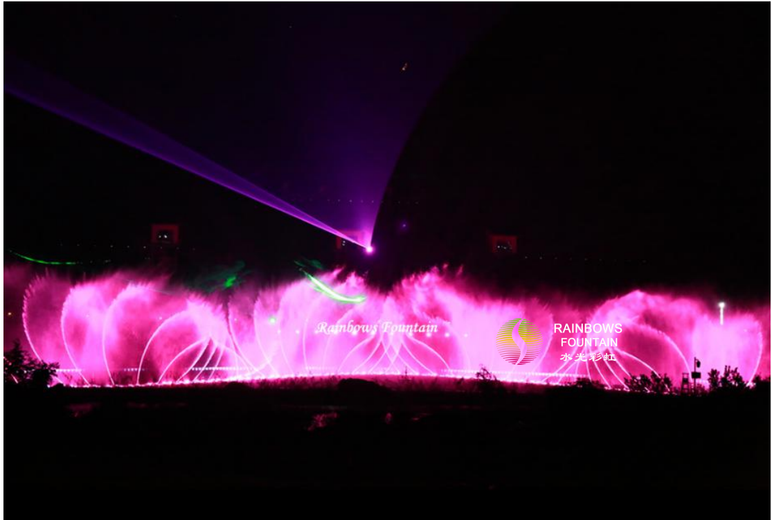
Fountain Design proposal and site situation